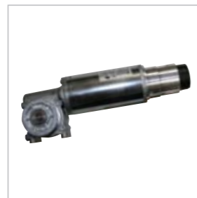
Heavy Duty Motor Gearbox