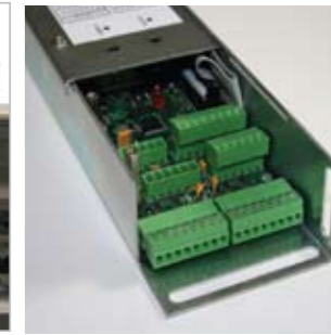
Dedicated sensor connections