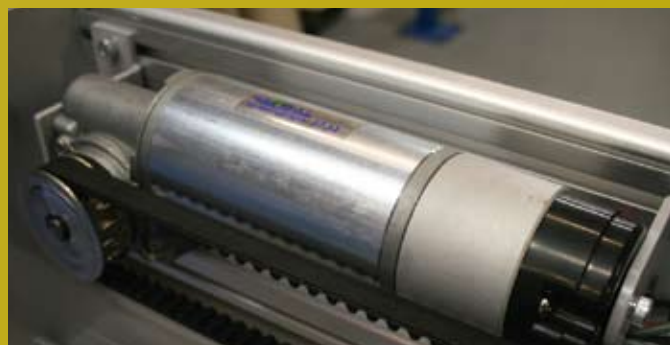
Heavy duty motor gearbox with integral electric lock