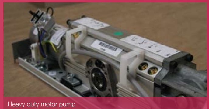
Heavy duty motor pump

The EMSW offers an excellent fire rating and is approved for fire door installations by the German and Swedish authorities.