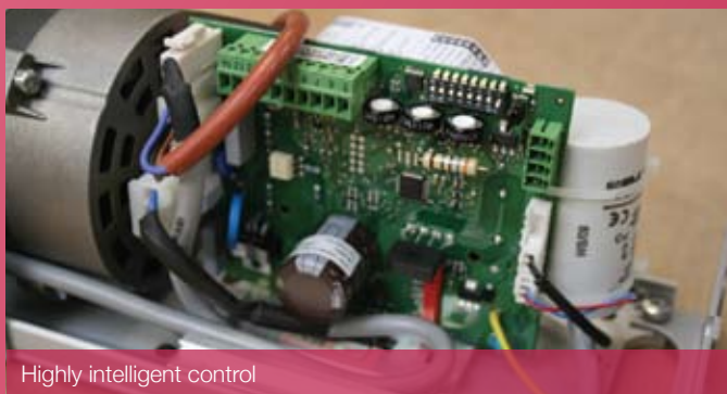
Highly intelligent control